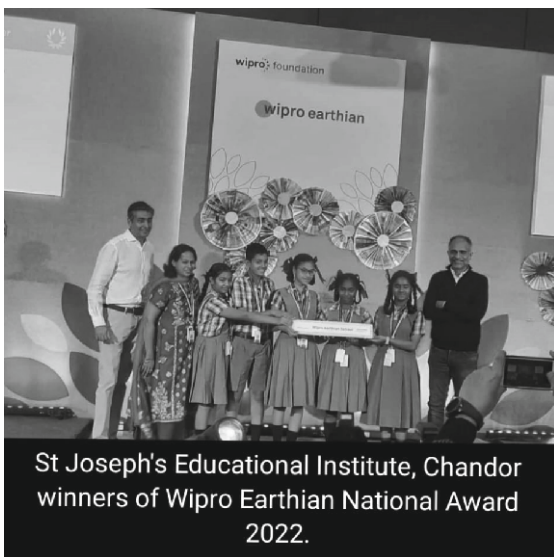
St Joseph's Educational Institute, Chandor winners of Wipro Earthian National Award 2022.